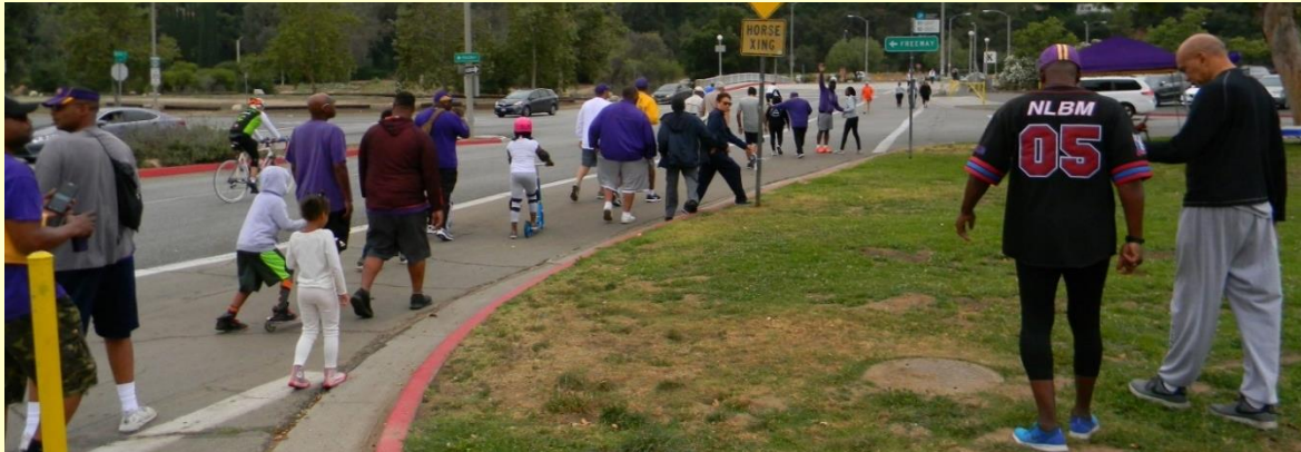
They walked side by side on a beautiful Saturday morning ...