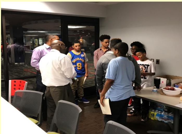
Planning Session with our Mentees