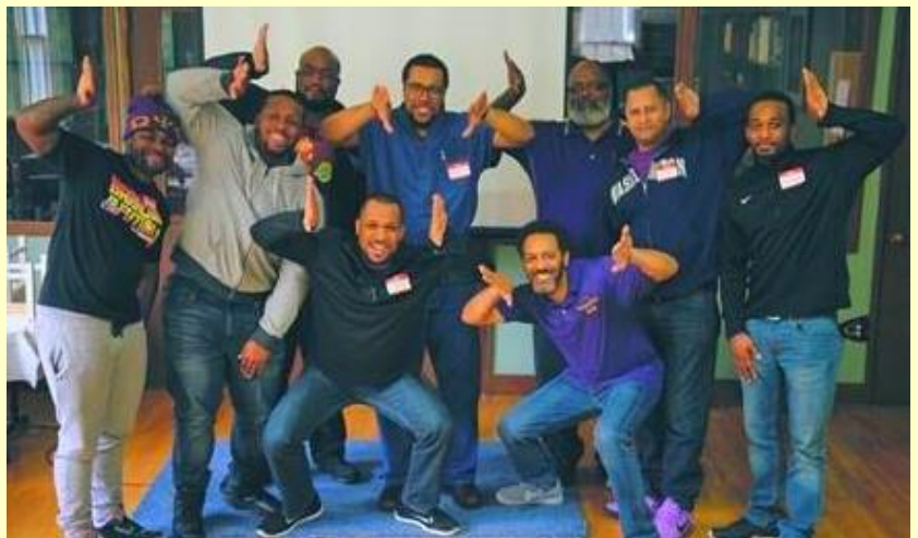
Seattle Brothers of Omega