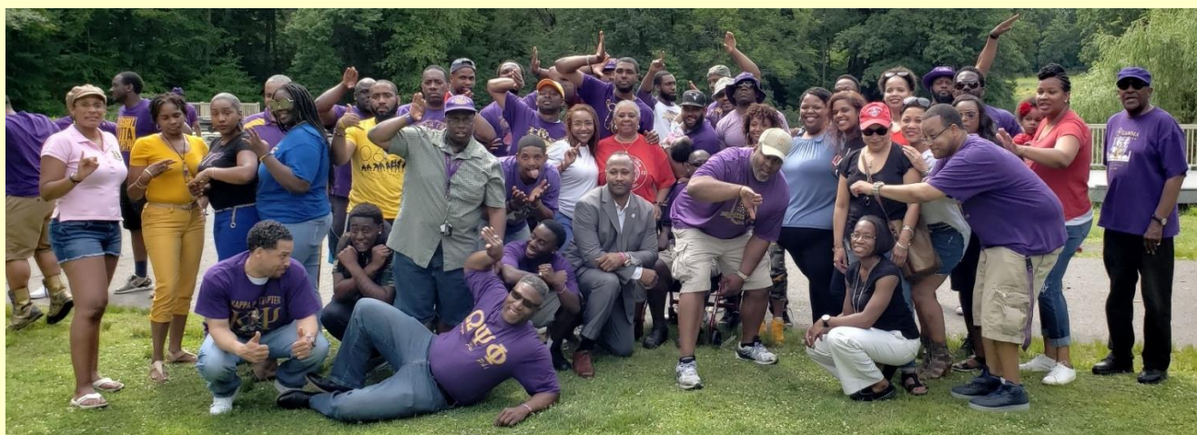
"Brothers at Keney Park, a central location where the community could come out to celebrate and acknowledge the work we do throughout the year."

Tau Iota host its annual celebration, to celebrate Black Men in the community and change the narrative of black fathers. Through several of its programs, Tau Iota has positioned itself as a leading advocate of Fatherhood initiatives and Men's health in the Greater Hartford area.