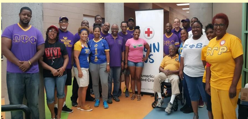
Dr. Charles Drew Blood Drive