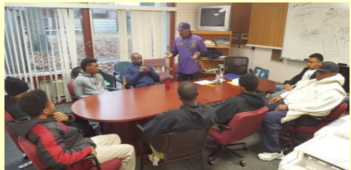
SOS Mentoring Program HS Rangers