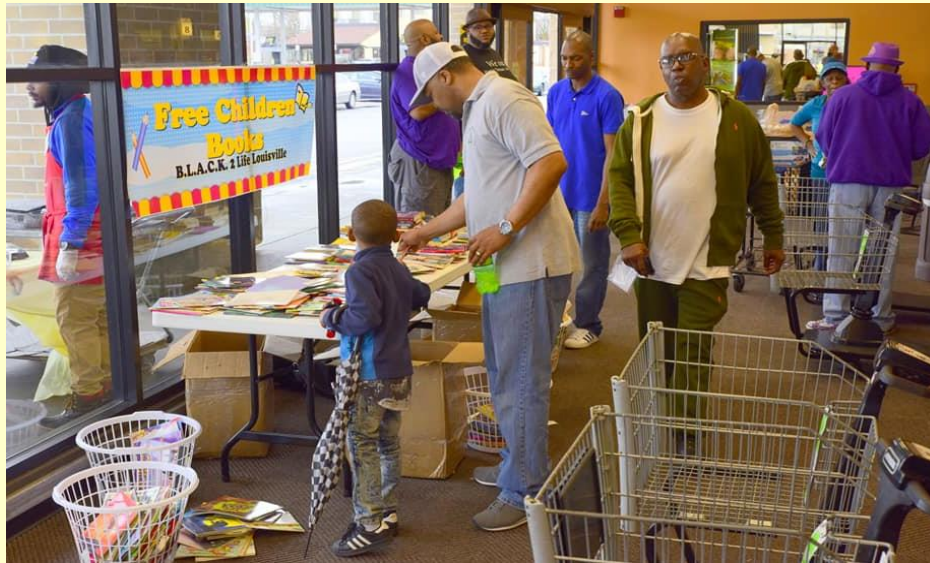
Black2Life NPO and Theta Omega Chapter Shop for Children's Books