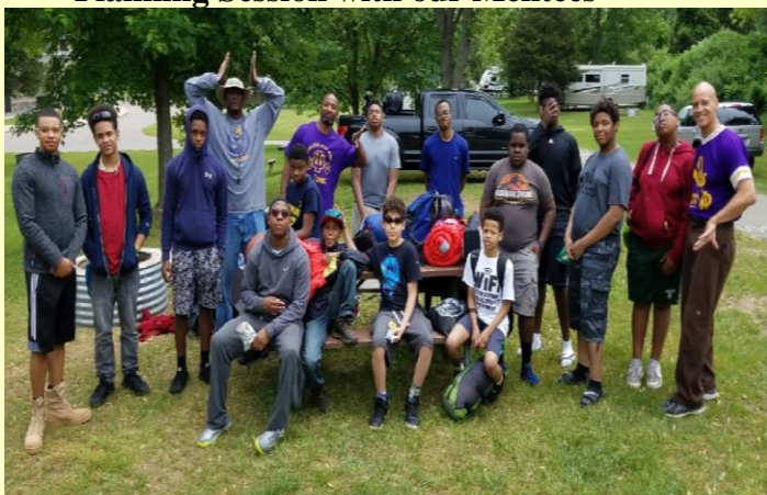
End of Year Camping Trip