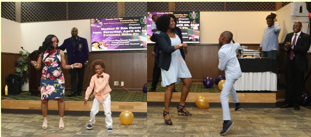
Young men participate in Mother & Son Dance Competition