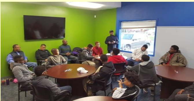
SOS Mentoring Program MS Rangers

The mentees' meet with the Omicron Xi mentors for a 90-minute session. A curriculum entitled "overcoming obstacles: life skill education" is used to stimulate critical thinking skills and mentee interaction. The mentoring sessions occur monthly on the second Saturday of each month for high school Rangers and every fourth Saturday of the month for middle school Rangers. The SOS Mentoring program has proven to be very effective and instrumental in providing encouragement and guidance to young African American males. Currently more than 63 Rangers will participate in the 2017-2018 Sons of Success (SOS) Mentoring Program.