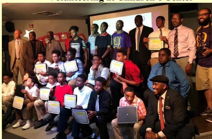
End of Year Ceremony