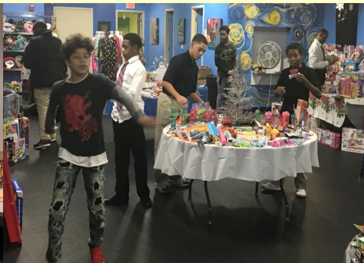
Volunteering at Children's Center