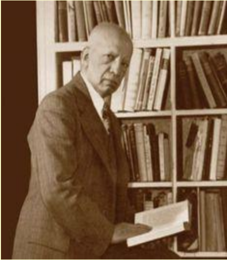
Brother Dr. Carter G. Woodson

“If we can finally succeed in translating the idea of leadership into that of service, we may soon find it possible to lift the Negro to a higher level.