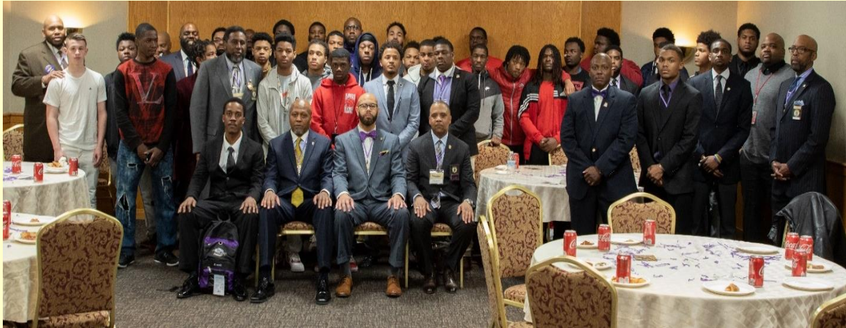
Brothers and Youth at the 77th Fourth District Meeting