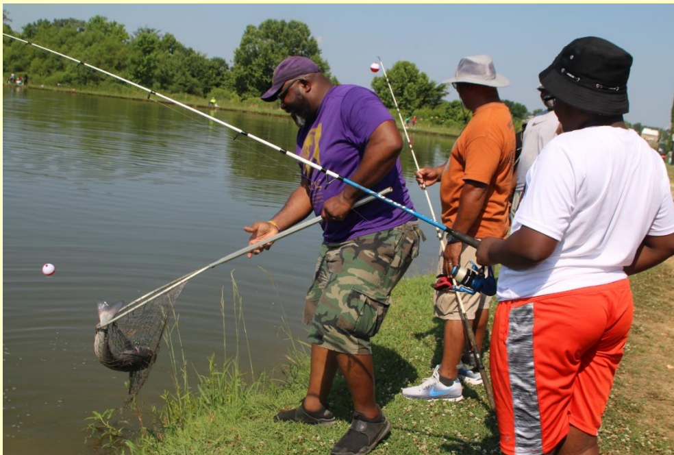
Fishing with Fathers