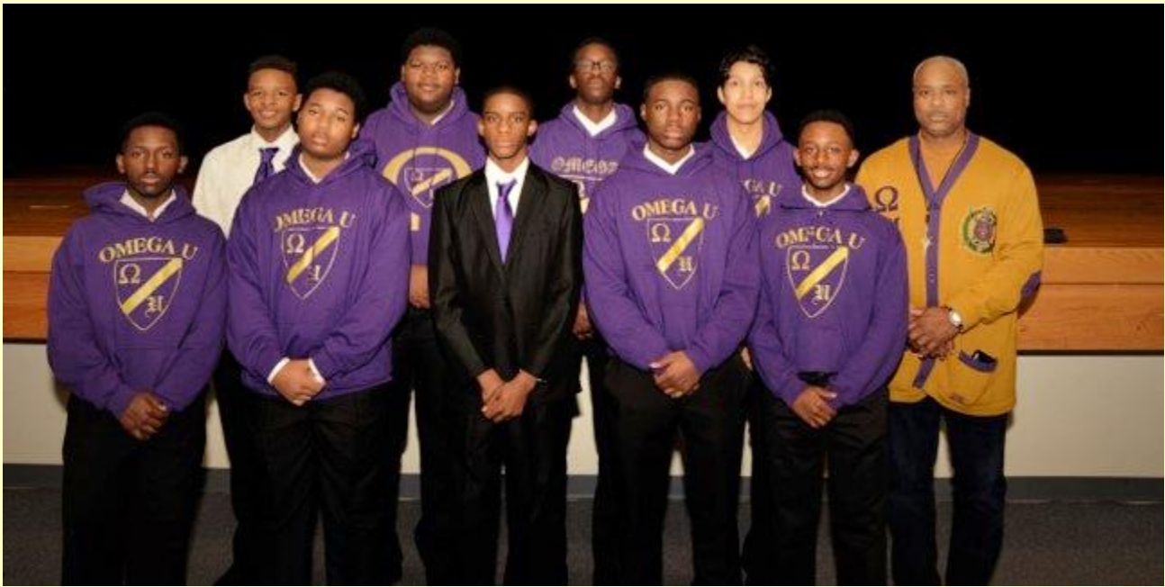
Omega U students from Potomac Senior High School sponsored and led the Omega U 2nd Annual Black History Program at Potomac Senior High School in Dumfries Virginia on February 24, 2018