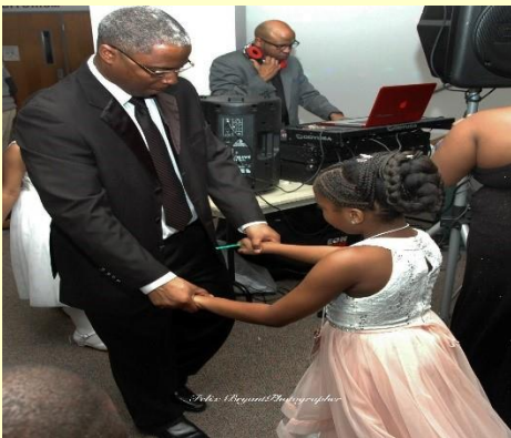
A Father enjoying the night out with his Queen during the Prince William County, Virginia, Father & Daughter Dance on Saturday, February 24, 2018

Prince William County, VA February 24, 2018 – The Brothers of Pi Lambda Lambda (PLL) Chapter, participated in the Father & Daughter Dance on Saturday, February 24, 2018, in partnership with the Prince William County (PWC) Social Services Program. Young ladies ages five to sixteen dressed in elegant, colorful dresses and were escorted by their handsome fathers and father figures who were equally dressed to impress.