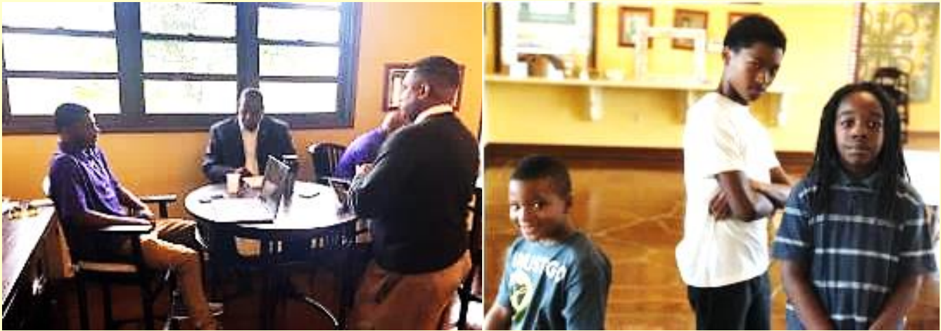
Mentees participating in Project Aspiration receive briefing from the Brothers of Lambda Beta Beta Chapter and participate in a team building exercise called "The Party"

Honolulu, Hawaii - On Saturday March 3, the Men of Lambda Beta Beta Chapter of Omega Psi Phi Fraternity, Inc., hosted an open house to launch their annual Project Aspiration program. The instructors lead the way with a detailed overview of each topic in this year's program. After explaining the curriculum, the mentees participated in an Ice Breaker exercise.