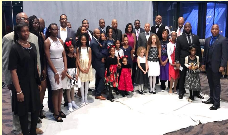
Brothers of Beta Iota and their daughters

Ω Fatherhood and Mentoring Tools and Tips website: www.omegafandm.org