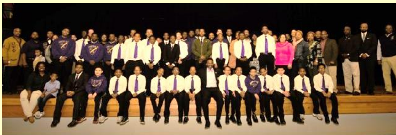
Omega U students, mentors, parents, and brothers of Pi Lambda Lambda take at the Omega U 2nd Annual Black History Program at Potomac Senior High School in Dumfries Virginia on February 24, 2018

Dumfries, VA – February 28, 2018 – Students, parents, mentors, and brothers of Pi Lambda Lambda attended a student led Black History Program at Potomac Senior High (PSH) School in Dumfries on February 24, 2018.