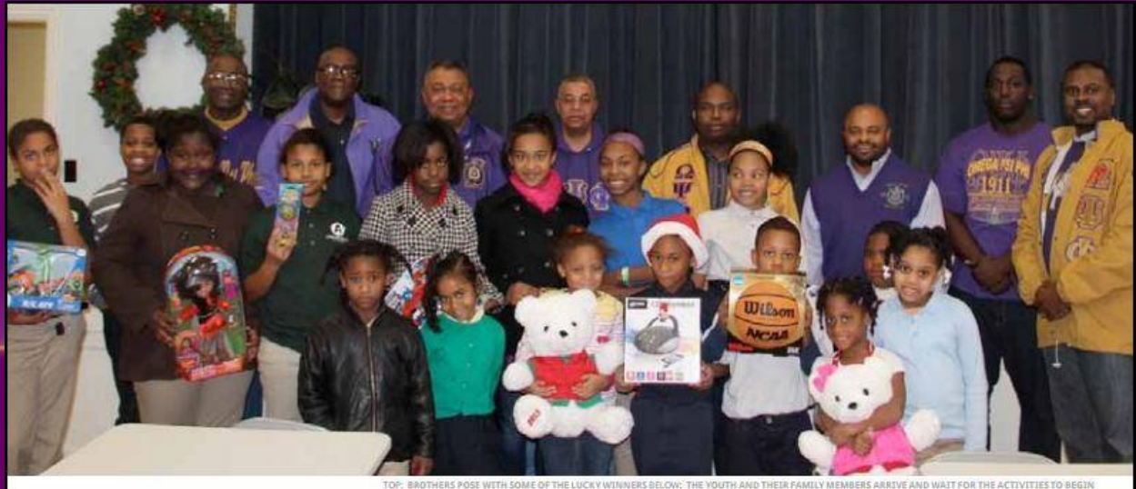
TOP: BROTHERS POSE WITH SOME OF THE LUCKY WINNERS BELOW: THE YOUTH AND THEIR FAMILY MEMBERS ARRIVE AND WAIT FOR THE ACTIVITIES TO BEGIN

“Being present is half the battle for a dad. The other half is being available and willing to do whatever it takes to make sure that your children feel safe and prosper.”