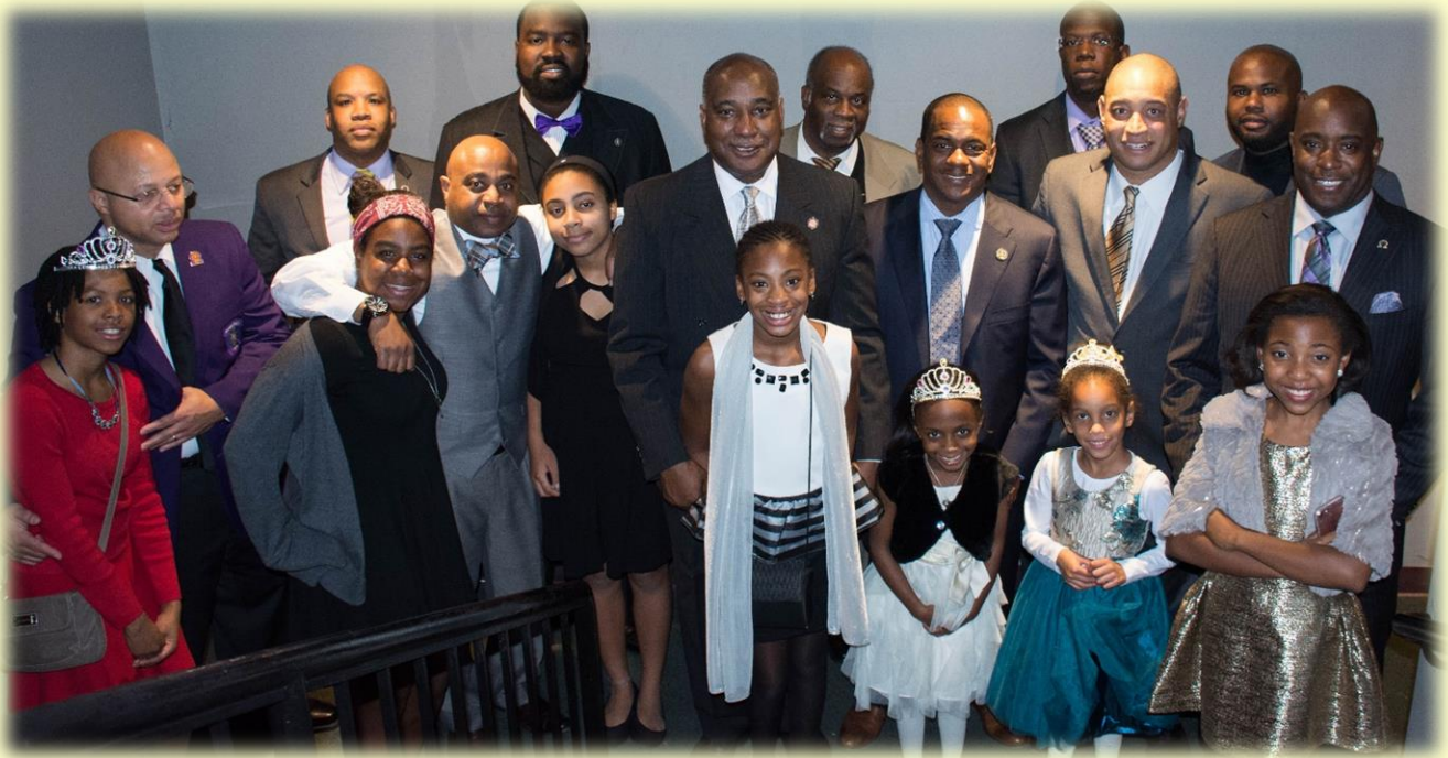
Maryland, Dads Dine and Dance with Their Daughters. Mu Nu says, “Fathers are important and special in the healthy development of children.” See story below.