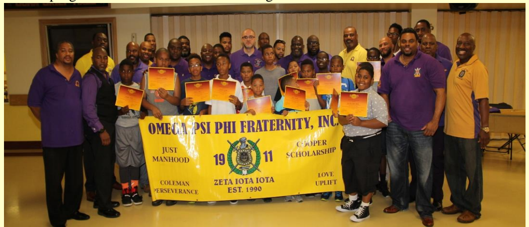
Zeta Iota Iota Chapter: Saving Lives One Youth at a Time!