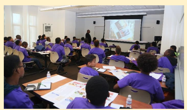
STEM: What Do I Need to Know to be 21st Century Workforce Relevant?

As the young men were leaving the venue following the conference, a 13 year old was asked what he had learned today. He replied that he learned that he always has a choice and that he doesn't have to do what others are doing if he knows better.