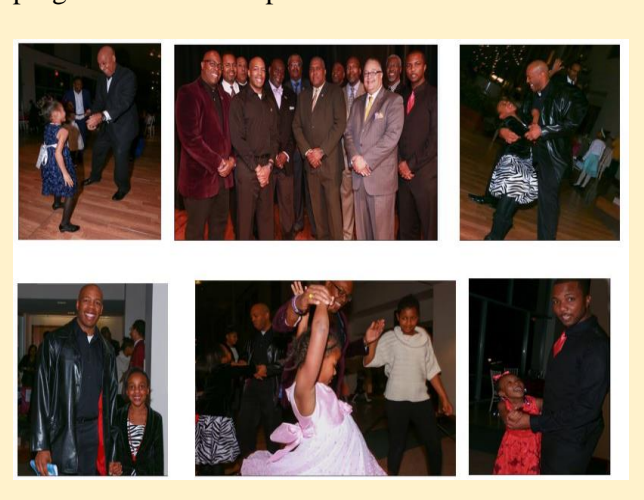
"Dancing with Daddy"

The County Social Services Chief has already requested our support for future Fatherhood programs. Below are photos from the event.