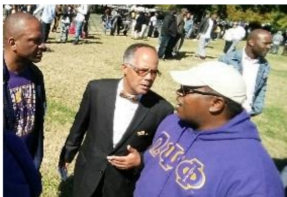
Brother, "we gotta talk about it."

The 7 th District supported the online Honorable Man National Pledge Campaign in great numbers in partnership with Fathers, Inc. In a repeat of the historic event that took place 20 years ago, Brothers traveled with their sons, daughters and youth groups for them to be able to tell their story and truths first hand to the next generation.