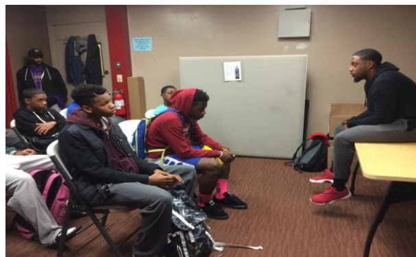
Choices, Choices, Choices – Decisions too!

Dorchester, MA - On Sunday November 15, 2015 brothers from Iota Chi held their annual brunch and ball community service event, where a panel discussion was held. They were joined by brothers from Delta Chi. The content of this discussion pertained to making the right decisions. The topic of this discussion was entitled “Making good choices”.