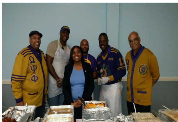
Alpha Nu - Doing Something for Others

Norwalk, CT – It's becoming a tradition that the Brothers of Alpha Nu Chapter forego the comforts of home, family and football to break bread with the homeless and other community residents on Thanksgiving.