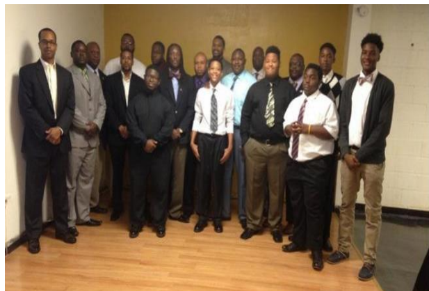
Omega Stars Youth Academy Graduates, May 2015

Richmond, VA - On Friday May 22 the Omega Stars Youth Academy had their closing ceremonies for the year. Eight students completed the program for the 2014–2015 school year. The Youth Academy is sponsored by the Phi Phi Chapter in Richmond, VA. To complete the nine month program, students are required to attend biweekly sessions each month.