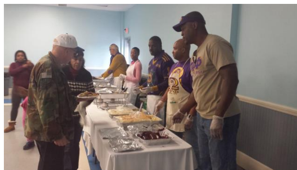
... but for the Grace ...!

Brothers attempt to encourage these men by helping them to understand that it is important to do what they can, but most importantly, to be an encouragement for their children, to listen to them and make sure that they know that you are there to guide, encourage and love them.