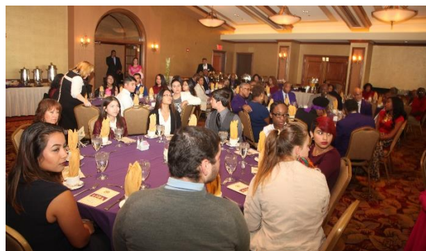
Cheyenne High Students Honored By Omega Fathers