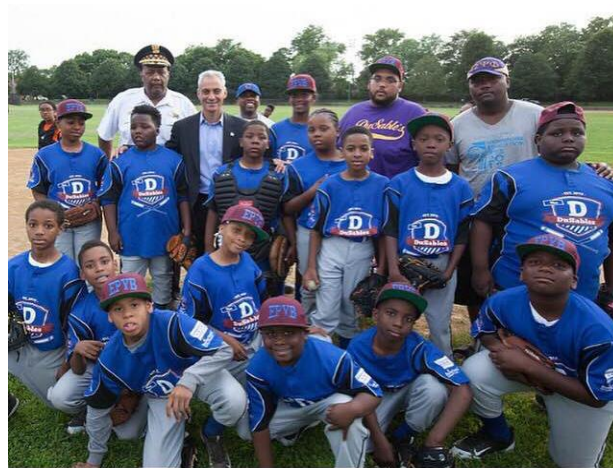
A Uniformed Police Officer, Omega Psi Phi, Iota Chapter and Chicago Mayor Rahm Emmanuel Rest Uneasy Souls!

“Our work ... commitment to its Cardinal Principles... to uplift our communities.”