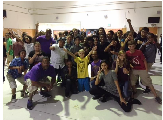
Brothers of Sigma Gamma Gamma with students attending Anti-Bullying Event at Kadena Middle School on Kadena Air Force Base in Okinawa, Japan.

The Brothers of SGG continued their anti-bullying campaign, from September 26, 2015 during the Que-Nic at Ryukyu Middle School on Kadena Air Force Base. Students from all ages attended the event which was combined with a large pep rally and opening games for the Middle School Football League. A total of over 1,700 students attended the event.