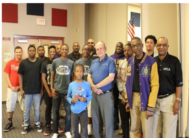
A Broad Partnership

Phoenix, AZ – On Saturday, December 5, 2015, the brothers of Phi Iota chapter and Omega Youth Leadership Academy mentees held a Financial Literacy seminar entitled Act Your Wage on the campus of Sierra Linda High School.