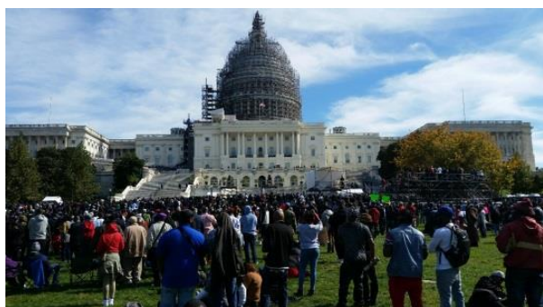
7th District Present for One Million Man March

Alabama, Florida, Georgia and Mississippi – Omega Brothers from the great states of Alabama, Florida, Georgia and Mississippi proudly represented the Mighty Seventh District traveling north to attend and actively participate in the 20 th Anniversary of the Million Man March in Washington D.C., Saturday, October 10, 2015.