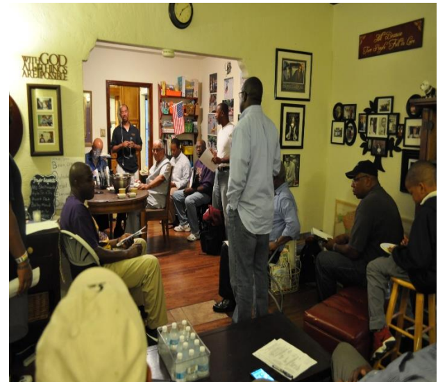
Omega Men: Fathers and grandfathers getting it right!