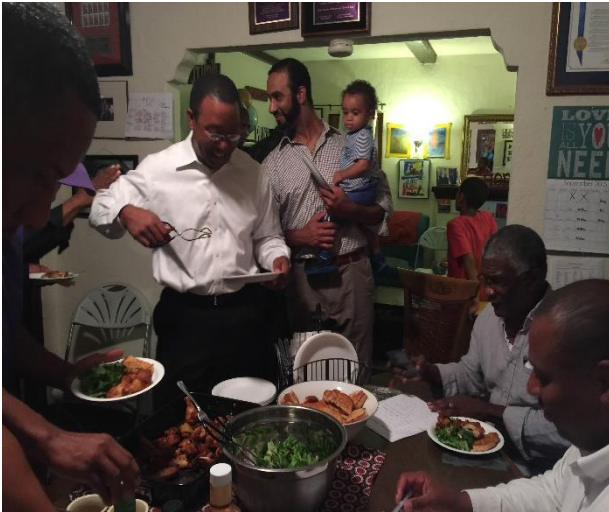
Friendship: Essential to Building Strong Communities