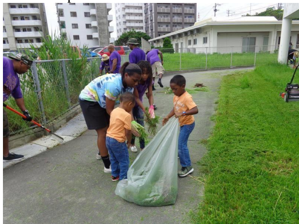
Fathers and Families Lending a Helping Hand

Okinawa, Japan – Community Service - Sigma Gamma Gamma Chapter joined forces with Okinawa Outreach on a community service project. Several Brothers came prepared to put in a hard day's work at the Okinawa Ichijo's retirement home for local Japanese citizens.