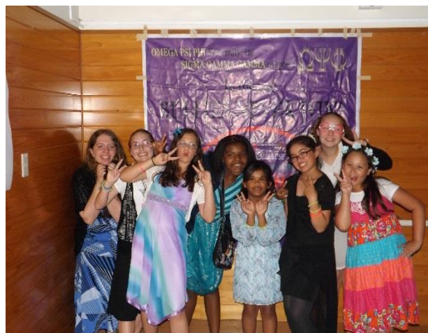
"Winners Never Bully – Bullies Never Win"