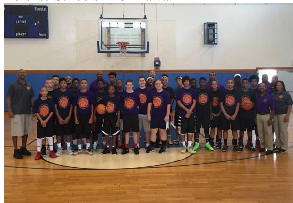
SGG, participants, coaches and staff, 1 st Basketball and Life Skills Camp, August 10 thru August 15, 2015, Kadena Air Force Base, Okinawa, Japan.