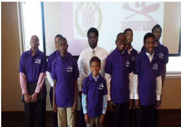
Omega Leadership Academy Promotion Ceremony

June 6, 2015, Denver, CO - Chi Phi Chapter honors the Omega Leadership Academy of Denver's Class of 2015 – 2016. The Leadership Academy is a flagship program of Chi Phi Chapter in partnership with the Holmes/Omega Scholarship Foundation.