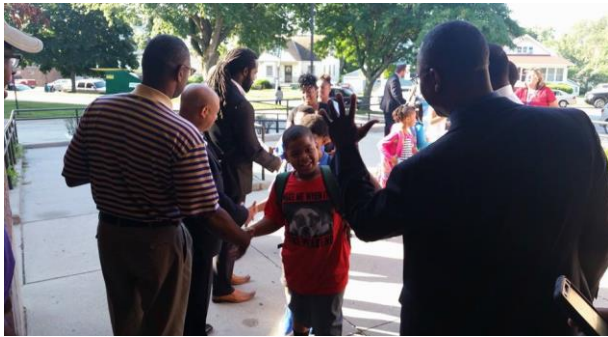
Omega men Welcoming Students Back to School

Omaha, NE - Beta Upsilon Chapter brothers welcomed back the young scholars of Central Park Elementary School. Beta Upsilon Chapter has an ongoing partnership with the Central Park Elementary School through its Project Manhood program.