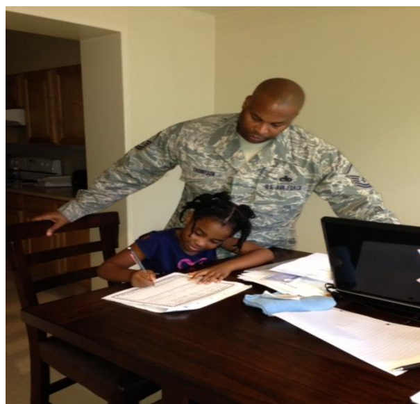
A Father's Story