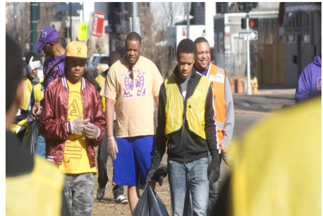
Omega Leadership Academy of Denver Chi Phi Graduate/Lambda Beta Undergraduate Chapters

The Fraternity has a proven track record with the Omaha Public School District for promoting educational excellence. Through its Project Manhood partnership for the past 11 years, it has had an established collaborative relationship with Central Park Elementary School. Members of the Fraternity have high expectations of all youth participants and maintain the highest standards of group mentoring.