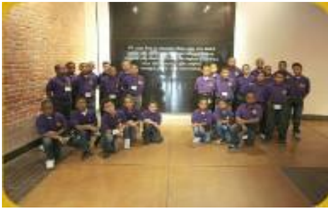
Oklahoma City Federal National Building Memorial Museum Visit

Oklahoma City, OK - In Oklahoma City, Project Manhood is a group mentoring program of the Omega Psi Phi Fraternity, Inc., Beta Upsilon Chapter. It is designed to inspire and assist at-risk and disadvantaged youth to learn life skills, to help build character and cultivate in youth a sense of responsible citizenship.