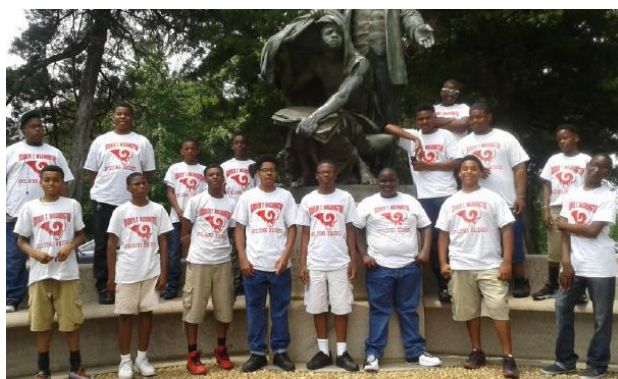
TIE'S Youth Mentoring Program, ALABAMA

In Alabama , Brothers of Rho Alpha Chapter in partnership with the Omega Community Outreach, Inc. (OCO), a 501 (c) 3 foundation that focuses on efforts to retrieve grants and other monetary contributions, provide scholarships to graduating high school seniors and undergraduate students who attain high academic excellence. Funds raised also aid other OCO community-based projects. Mentees from TIE'S Youth Mentoring Program are shown below on the campus of Tuskegee University in front of the venerable Booker T. Washington Monument.