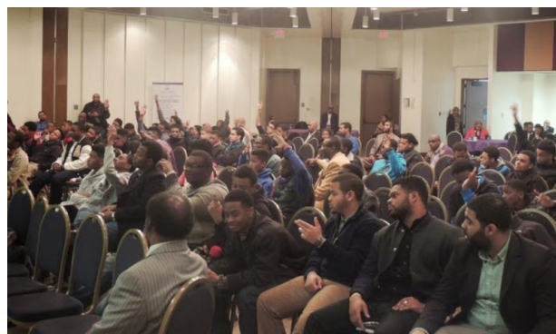
Phi Kappa Kappa Chapter/Project Friendship, GEORGIA

In Georgia , the Phi Kappa Kappa Chapter and Project Friendship hosted its Male Youth Leadership Conference & Fatherhood Initiative, February 20-21, 2015 at the Omega Psi Phi Fraternity, Inc., International Headquarters. The initiative aimed to educate male youth, grades 8 thru 12, and provide them with life skills and tools that will inspire them to be productive citizens and positive future fathers. Other scheduled Fatherhood rallies were: Augusta, Ga – June 13, 2015 and Atlanta, Ga. - June 20, 2015.