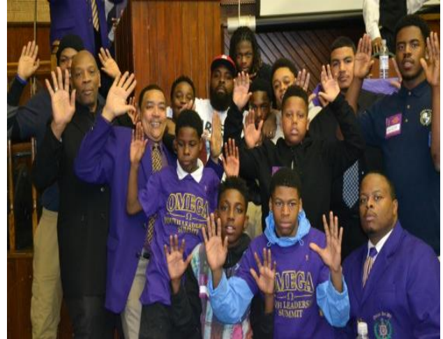
St. Louis, MO – Making a Difference in the Lives of Black People

Events in Ferguson surrounding the death of Michael Brown, an unarmed black teen, pressed the Fraternity into organizing the summit. The goal was to teach the young males vital lessons about life while reminding them that they are not alone.