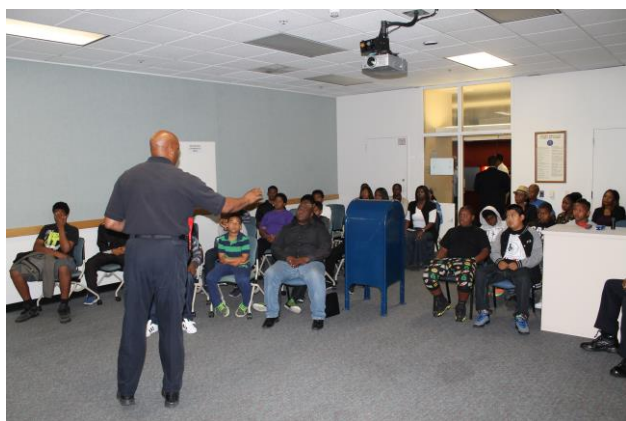
Mentees and Program Staff

Street Law Academy: During the final day of the Street Law Academy, boys and girls and their parents were treated to police action situations via the LAPD simulator. This activity was part of the Street Law Academy's curriculum. Its purpose was to demonstrate to youth and their parents what police officers see when confronting violent suspects and when the situation demands the officer make a quick and often life or death decision.