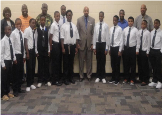
Ambassadors, Evers Academy for African American Males - MISSISSIPPI